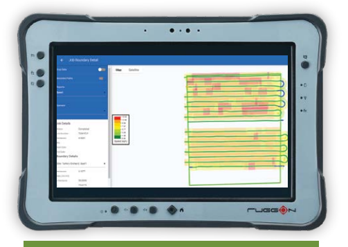
SPEED REPORT FOR DRIVEN PATH