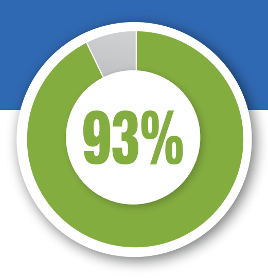
Up to 93% Less Run Off