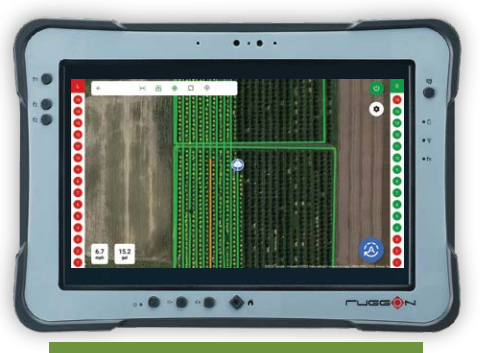
TRACK JOB PROGRESS (INCLUDING LOCATION AND VOLUME)

Losing paper documents is common, but with Smart Apply, your data is quickly uploaded and safely stored in the Cloud, allowing you to easily access both historical and real-time data whenever you're connected to Wi-Fi.