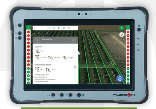
TREE COUNTS, SIZE, VOLUME OF TREES AND VINES

Precision spraying is just part of the Smart Apply equation. Its precision data capability automatically collects and uploads a variety of information to the Cloud for analysis, compliance, and planning. With Smart Apply's data, you gain insights into the productivity, profitability, health, and sustainability of your orchard or vineyard. The GPS-enabled software facilitates automatic spraying and records key details like date, time, spray volumes, chemical savings, tree counts, canopy volume, and area covered.