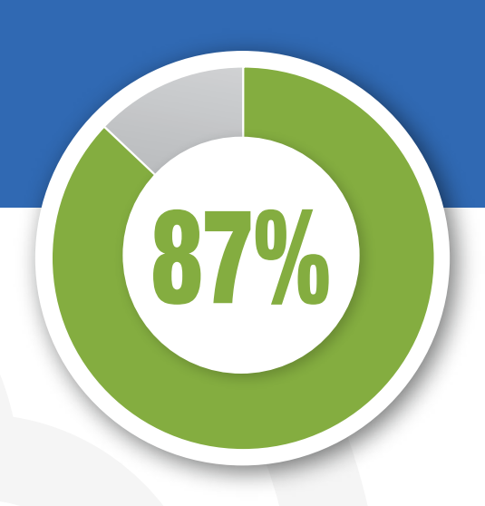
Up to 87% Less Airborne Drift